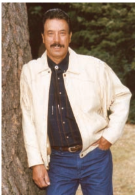
Monte Church, June 14-18 at 9:30 a.m.