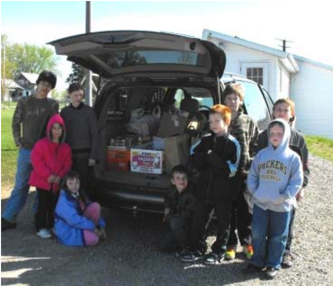
Students from Maranatha SDA School

The students solicited pledges for food donations based upon how much exercise they did in a prescribed amount of time. Nine students in grades 1-7 turned in 138 hours and 3 minutes of exercise time for the Exercise-A-Thon between May 1 thru May 10 (some of their exercise time