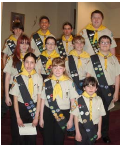
Wisconsin Rapids Pathfinders