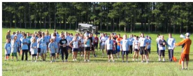
Starting line at 2008 Hallelujah Hustle

Spring is just around the corner and with it comes the time to begin training for the third annual Hallelujah Hustle. Dedicate the next few months to getting in shape for this 5k (3 mile) run/walk, which will take place on Sunday,