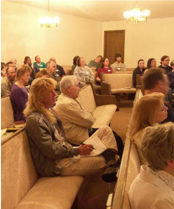
Stevens Point Meetings

Evangelism is a process! There is seed sowing, cultivation of interest and then there is harvest. In their cycle of evangelism, the Stevens Point Seventh-day Adventist church holds evangelistic reaping meetings as part of their