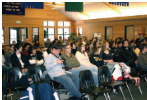
WA Students at Camp Wakonda