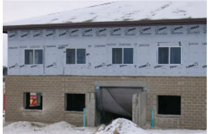
Windows on the southside of building

installed. By the time you read this, the lower level window installation should be completed as well as the east end of the upper level. Interior walls are being