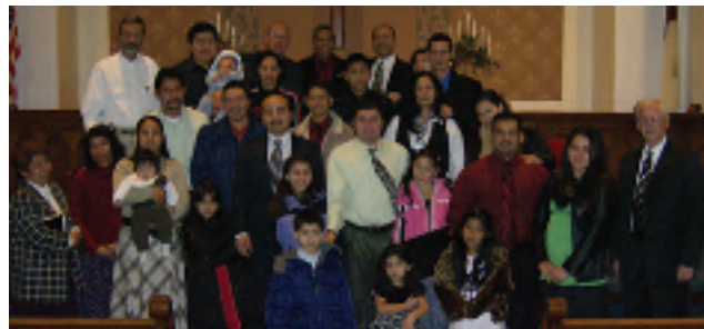
Everlasting Gospel SDA Spanish Company in Stevens Point.