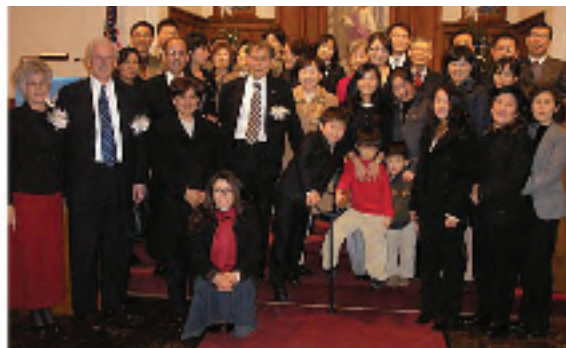
Wisconsin Korean SDA Company in Racine.