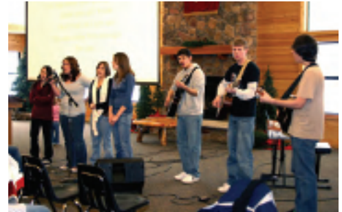
Praise Team leads out in song service