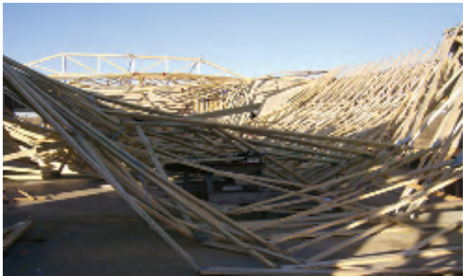
Fallen trusses looking to the west end of building.

which includes a picture of the downed trusses. The last page of the photo album will contain the most recent pictures.