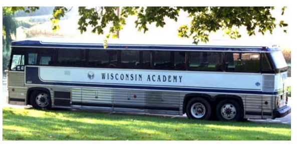
WA touring bus after the new paint job.

A list of all of the schools can be found on the website, http://wisc.netadventist.org/