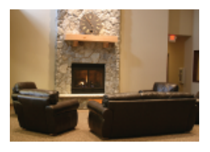
Fireplace in lobby of Boys' Dorm