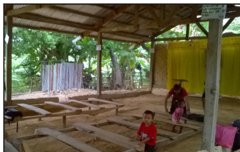
The Marcilla congregation has already torn down this rough structure and begun the foundation for their new church.