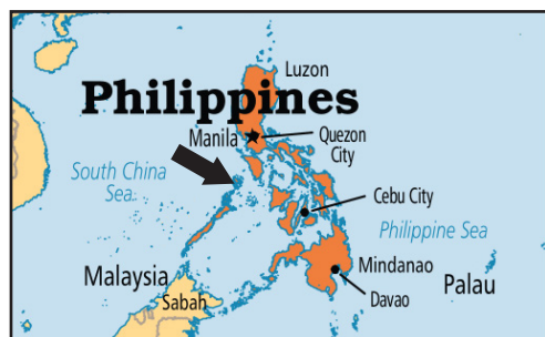
Marcilla is a small fishing community near Coron in the province of Palawan in the Philippines.