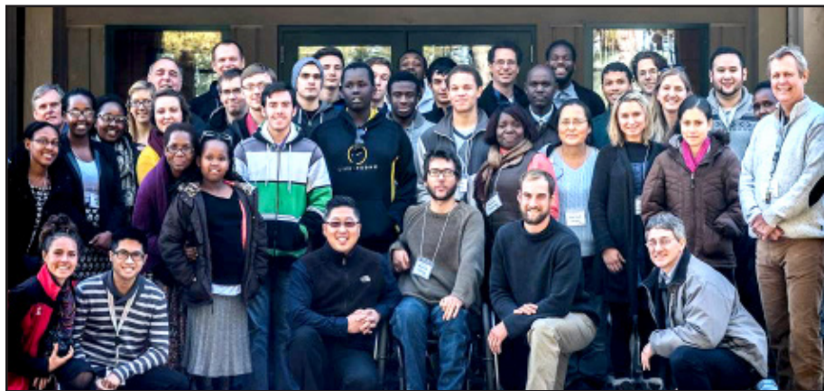
Over 50 people received inspiration to share Christ on Wisconsin public campuses at the recent PCM retreat.