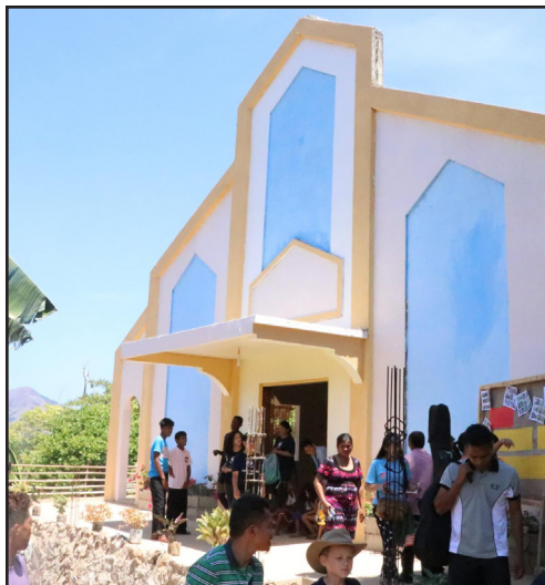
The church we built two years ago in Marcillia as it stands today. Our group took part in the dedication of this beautiful house of worship.