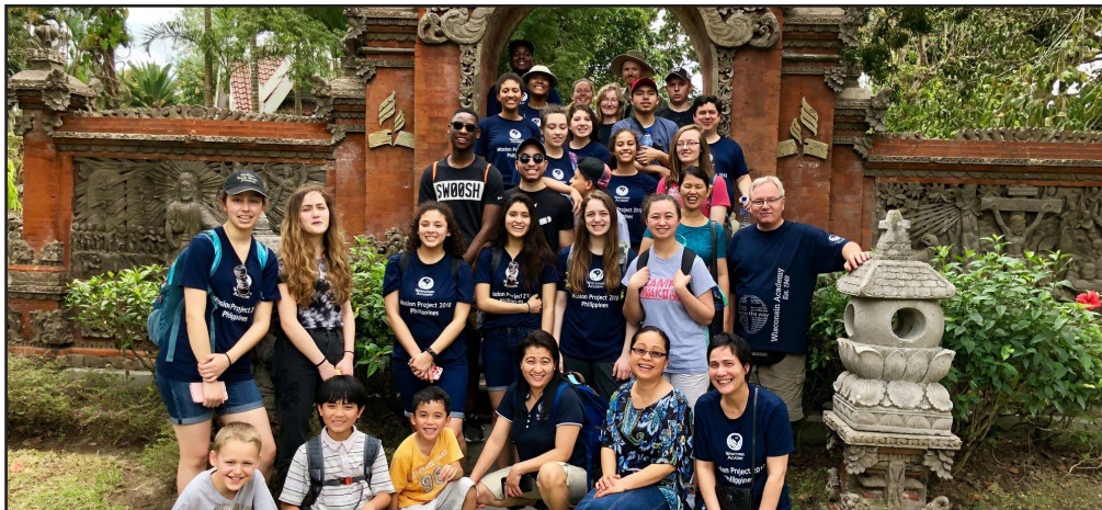
Our team of 32 students, staff, and friends spent 17 days on WA's second project in the Philippines.