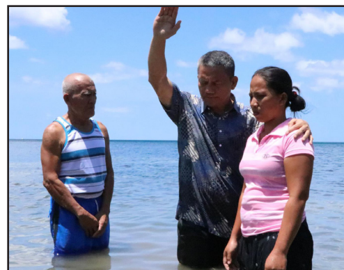
A new believer gives her life to Christ through baptism. Nineteen people were baptized while we were there, and more are preparing.