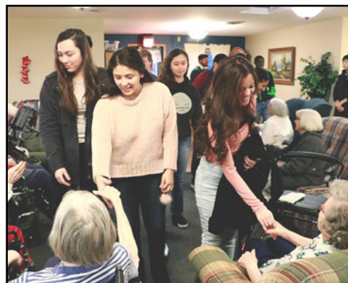
Students interact with residents at an assisted living center. This winter, we have spent several Sabbath afternoons singing and visiting at nearby hospitals, nursing homes, and centers.