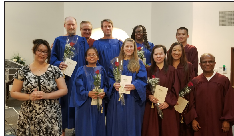
Pictured above are the nine who were baptized as well as one profession of faith at the Madison Community church, following their evangelistic campaign.