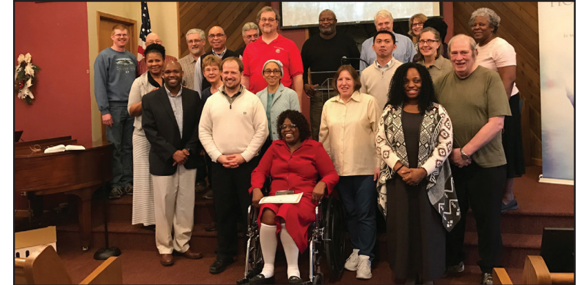
Some of the first graduates from the 2016-2017 Adventist Lay Seminary held in Wisconsin. This 2016-2017 certification focused on Bible worker training.

In February of this year, Wisconsin Conference became the first conference in the North American Division to provide the Adventist Lay Seminary program to their English speaking members, graduating over 25 English speaking lay people. At the same time over 60 Wisconsin Hispanic members graduated from the Adventist Lay Seminary program, a first for the Wisconsin Hispanics.