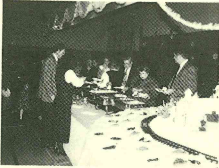
Wisconsin Academy Christmas Banquet

Throughout the winter months, Wisconsin Academy staff and students have had various opportunities to show their love for others.