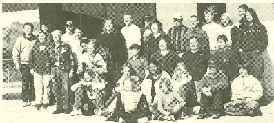
On March 18, 2003, 32 participants from Wisconsin boarded a green school bus and headed for Ciudad, Victoria, Mexico. Over the next ten days, they held four evangelistic meetings, built a school playground, helped build a new Adventist Church and assisted local Adventists with Bibles, building materials, school equipment and money. The Fox Valley, Green Bay, & Sheboygan Churches gave leadership to the project.