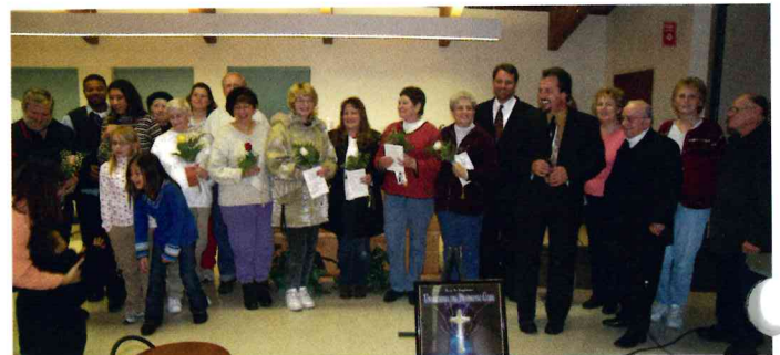
Nearly 25 people dedicate themselves to be part of the new Fond du Lac Fellowship Group at the close of the Adventures in Prophecy meetings